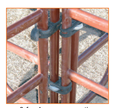
3 for 4-way connection