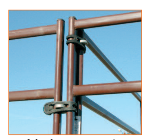
2 for 3-way connection