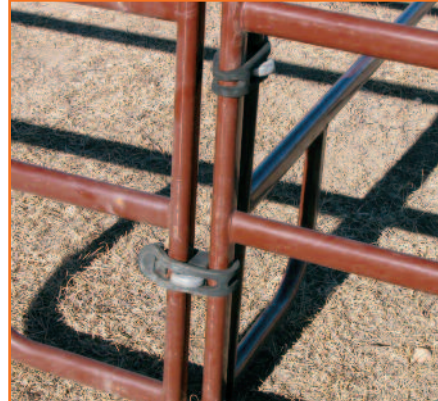
2 for 3-way connection